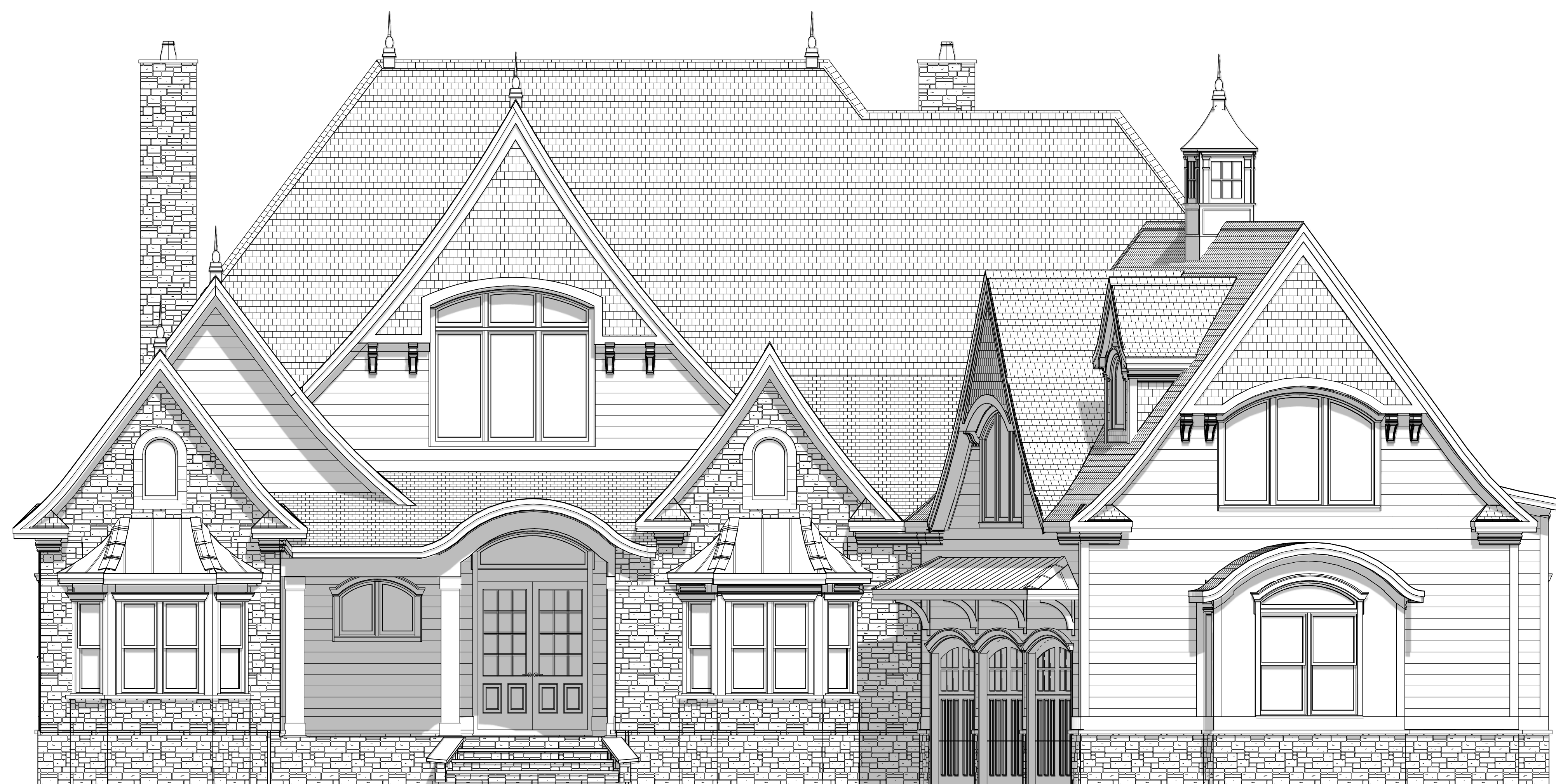
FRONT ELEVATION 1/4" = 1'0"