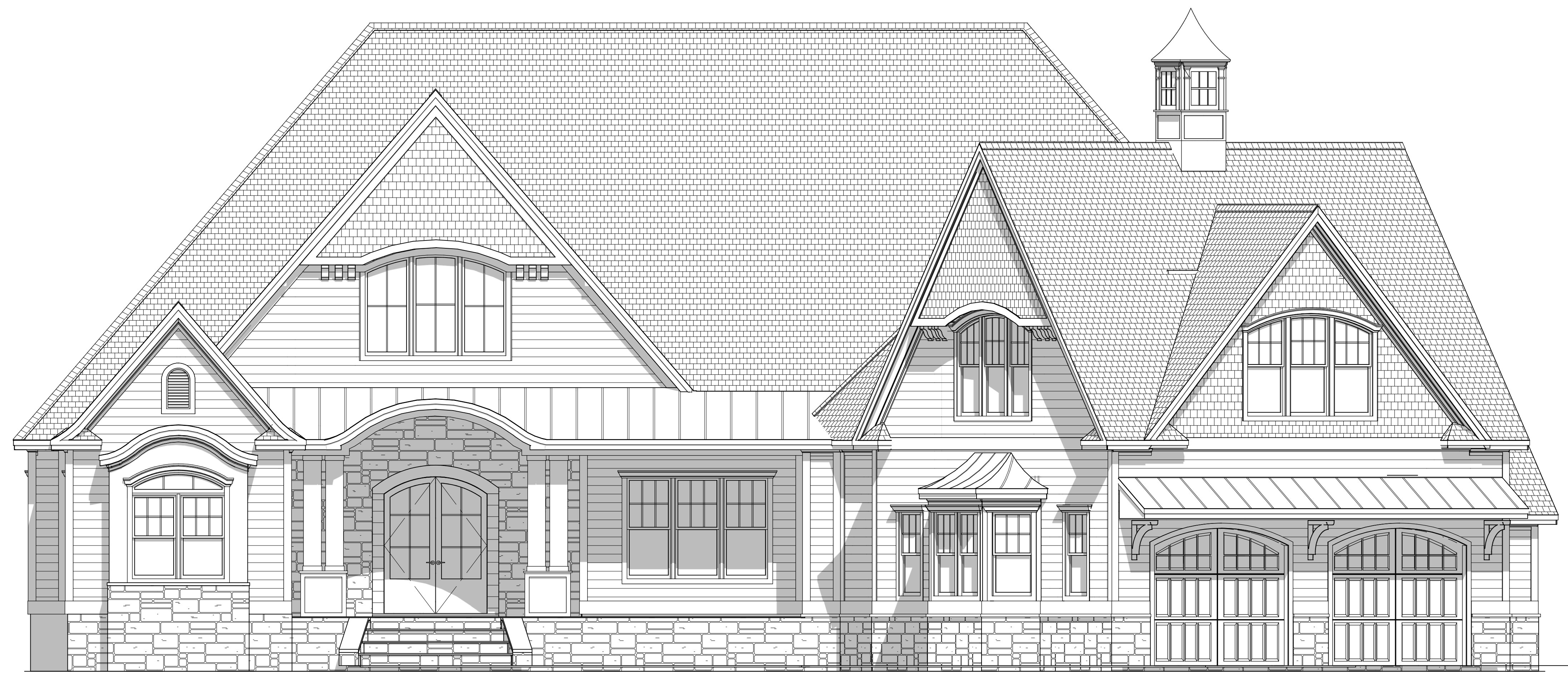
A FRONT ELEVATION A-1 1/4" = 1'0"