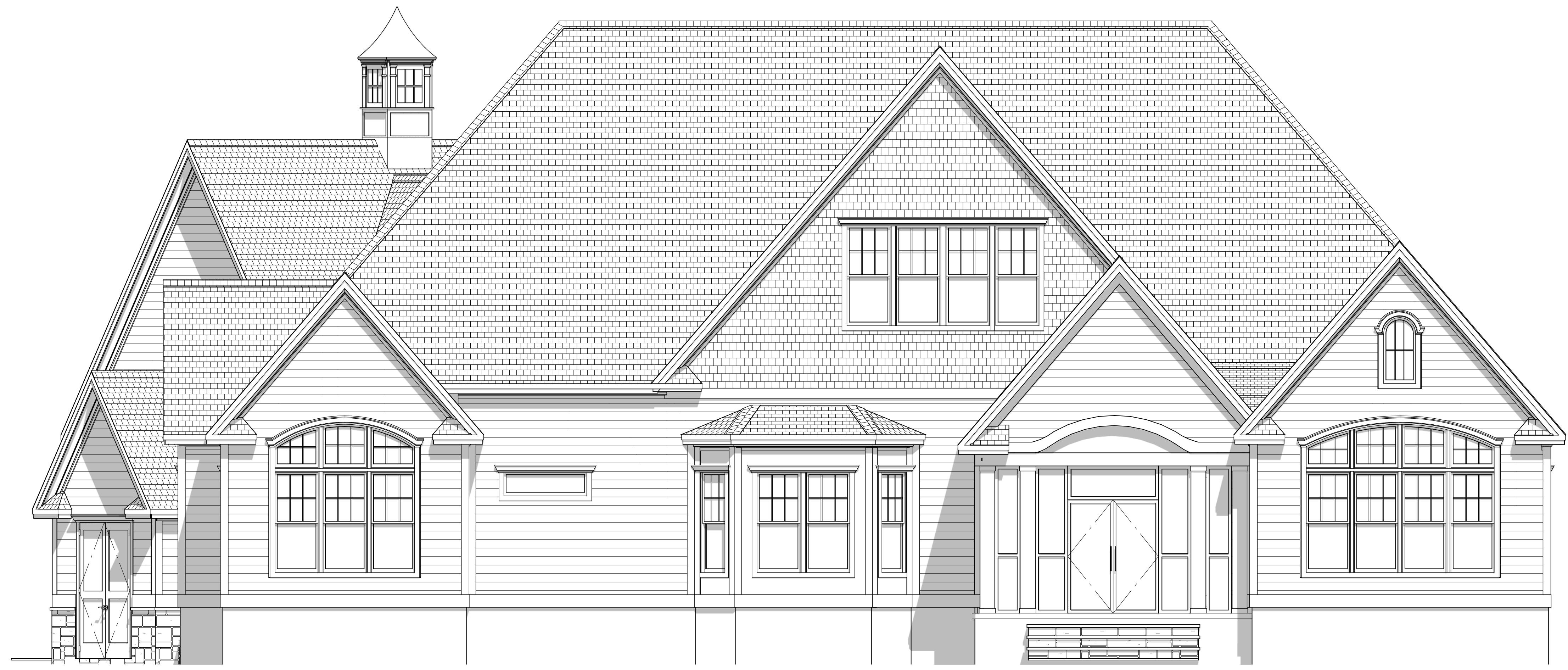
D BACK ELEVATION A-1 1/4" = 1'0"